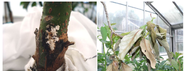
Figure 4. a) A bore-hole from a redbay ambrosia beetle surrounded by dried sap (white-crystal-like) from an avocado stem and b) wilted leaves of laurel-wilt-infected avocado tree.