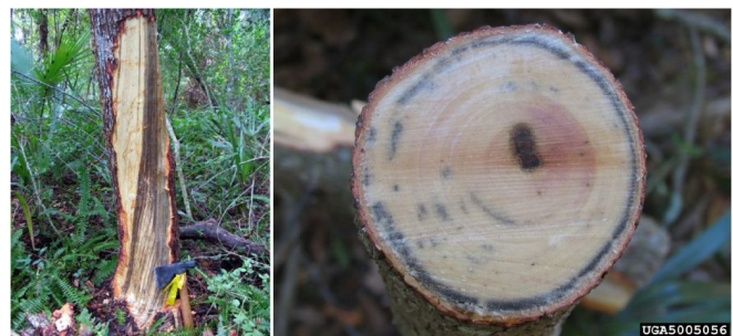
Figure 5. Symptoms of laurel wilt in redbay trees: a) removing the bark reveals dark staining of the sapwood and b) the dark color of the outer ring of sapwood below the bark indicates the tree has been infested by the redbay ambrosia beetle and the wood colonized by the laurel wilt fungus. The fungus that has colonized the sapwood blocks water and nutrient movement in the tree.