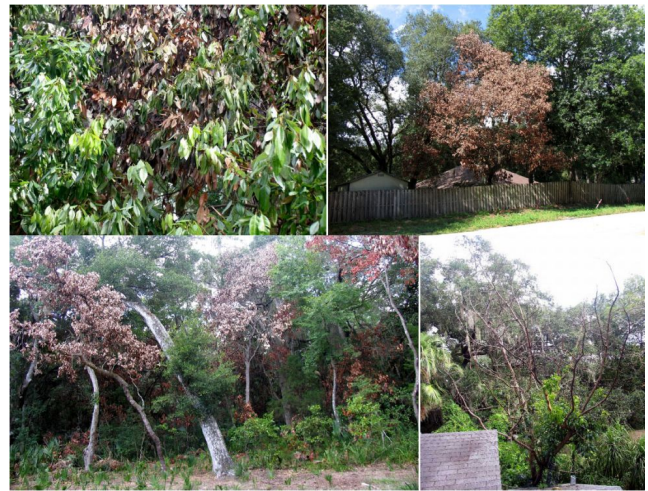
Figure 3. Whole redbay trees killed by laurel wilt.