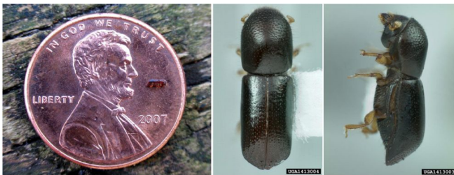
Figure 1. Redbay ambrosia beetles ( Xyleborus glabratus ): a) comparison of beetle to a penny; b) top view and c) side view of a single adult.

The redbay ambrosia beetle is very small (about 2 mm long), dark brown to black, and cylinder-shaped. To the unaided eye it is similar in appearance to other ambrosia beetles found in Florida (Fig. 1). Female beetles fly and are much more numerous than the smaller, flightless males. It is important to note that the redbay ambrosia beetle would not likely kill trees nor be a pest without the disease-causing fungus it carries.