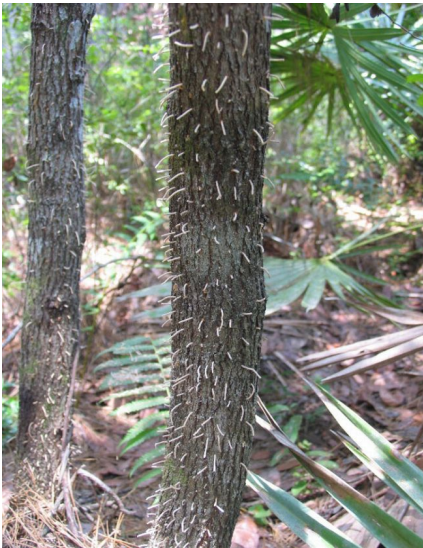
Figure 6. Small strings of compacted sawdust protrude from the small bore holes along the trunk of a tree.