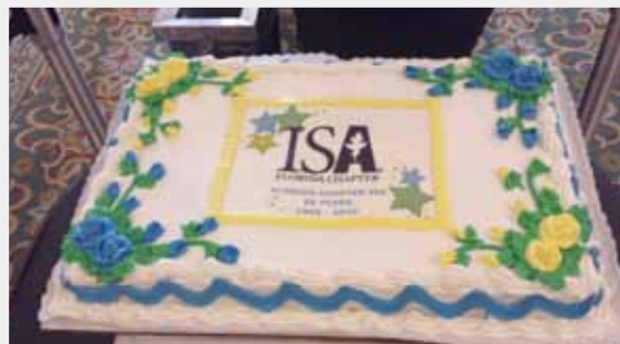
20-years and soaring to new heights!