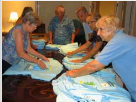
Up to our elbows in t-shirts!