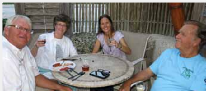
Everyone enjoyed the outdoor social.